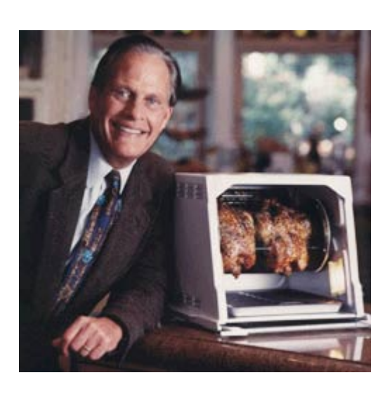
Set it and forget it! ~ Ron Popeil